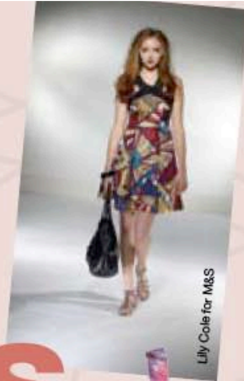
Lily Cole for M&S