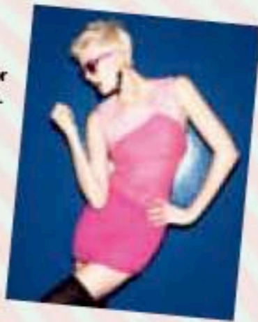
'Gold by Giles' Collection for Agyness Deyn at New Look.

From West LA to casual Summer Camp cool, this 70s inspired look effortlessly combines comfort with style. Stars and stripes are the essential patterns with wide leg trousers key pieces for your wardrobe.